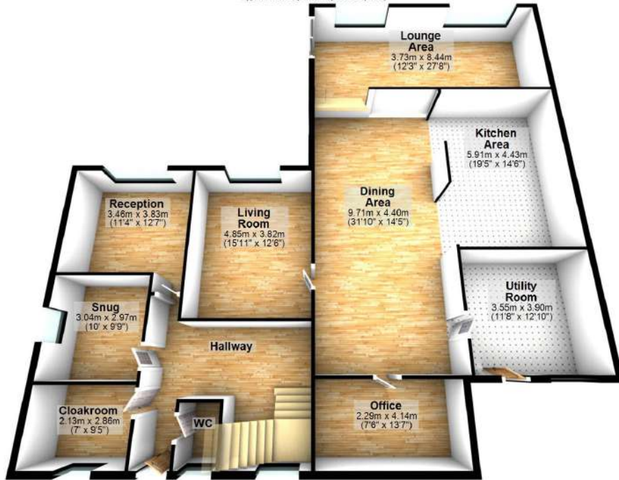
Ground Floor Approx. 196.0 sq. metres (2169.9 sq. feet)